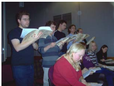
Policemen and some of the Major-General's daughters.