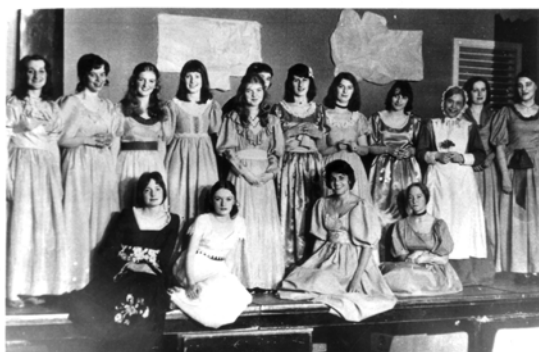
The female cast of Pirates 1973 in Derwent dining room.

We're hoping to create a display of material from our archive to show at the celebrations. If you can help us with copies of any old photos or descriptions of your memories of the society, please email or send them to us at the address below. We've already had a photo of our first show, which is very exciting!