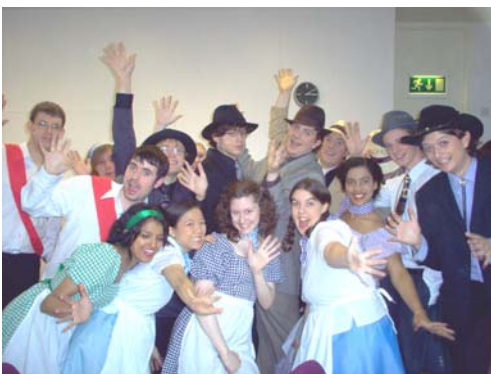
Some of the cast of Guys & Dolls back-stage.

In May we tried a new event, a joint weekend away with Manchester Universities Gilbert and Sullivan Society. We cast, rehearsed and performed a concert version of The Gondoliers with dialogue in 48 hours! Everyone involved had great fun and we hope to repeat the experience with a return visit to Manchester.