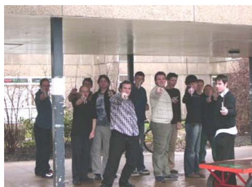
The 35 th Dragoon Guards brandish their swords before Patience .

If you have fond memories of shows, socials or other activities you were involved in with the society, whether it was three years ago or thirty, we'd love to hear from you! We're trying to add to our archive and need YOUR memories of what went on in bygone days. Email or write to us at the address below. We look forward to reading your contributions!