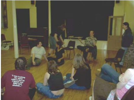
Fun and games on the 48hr Gondoliers weekend away.